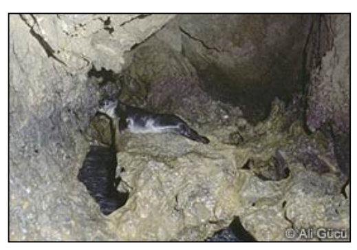
Figures 2 & 3. Seal caves with typical characteristics in the Cilician Basin.

The scarcity and importance of breeding caves and the dwindling state of the fish stocks are the main concerns in developing the conservation strategy designed and applied in the region. Two core zones, covering the near vicinity of the breeding caves, and a large fishery regulation zone in which only small-scale fishing operations by local artesanal fishermen are allowed, were designated along the Cilician coast in 1999. With this approach, young seals are protected against entanglement in fishing nets. Although some illegal trawling still occurs, the previously heavy fishing pressure on fish stocks has also been remarkably reduced. More importantly, the local small-scale fishermen, who are indebted to the seals for their exclusive coastal resource use rights, no longer see the seals as a pest to exterminate.