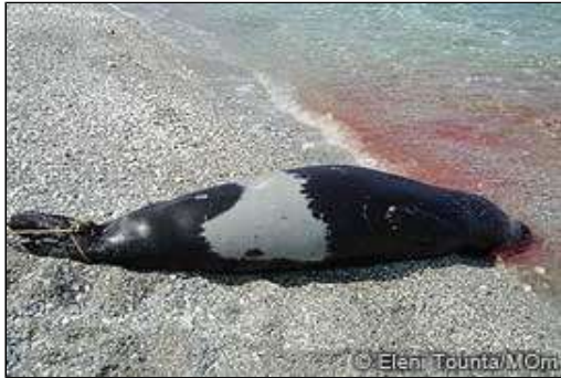
Dead on Milies beach.

The Port Police office in Glossa subsequently alerted MOm staff on Alonissos. A necropsy performed by MOm biologists revealed that the animal had been shot. A bullet, misshapen by striking the skull, was removed from the 3 cm head wound.