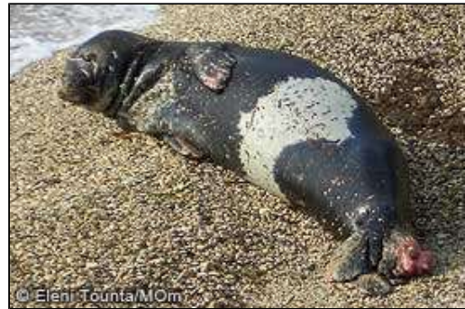
Relaxing on Patitiri beach.

A male monk seal frequenting the southern coasts of Alonissos is displaying some uncharacteristic behaviour for a species whose temperament in recent history is most often described as shy, retiring and even monastic in nature. This particular individual has been hauling out onto beaches on Alonissos, in the Northern Sporades Marine Park, generating alerts to the local MOM office by baffled fishermen and startled tourists. Despite initial concerns last September when the seal was sighted occupying a small beach just outside the village of Votsi, the animal did not appear to be suffering from anything more acute than wounds to its rear flippers (a common injury among competing adult males). And since then, sighting the seal on an open beach has become an increasingly common occurrence. In early June, in fact, townsfolk of Alonissos' main settlement, Patitiri, were amazed to find the seal asleep on the beach only a few metres away from shops, tavernas, and the busy hydrofoil port. – WMJ.