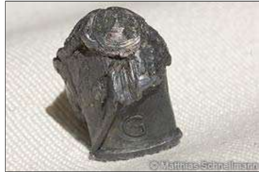
The bullet removed from the dead seal, misshapen by the force of entry, still shows the etched 'G' of its manufacture.

Although direct killing by fishermen remains the primary cause of mortality for the species in Greece, such incidents have been virtually unheard of in the neighbouring NMPANS for a decade or more. Indeed, local fishermen on Alonissos were among the first to condemn the killing, and noted that prevailing currents appeared to make it unlikely that the seal had been shot in their fishing grounds.