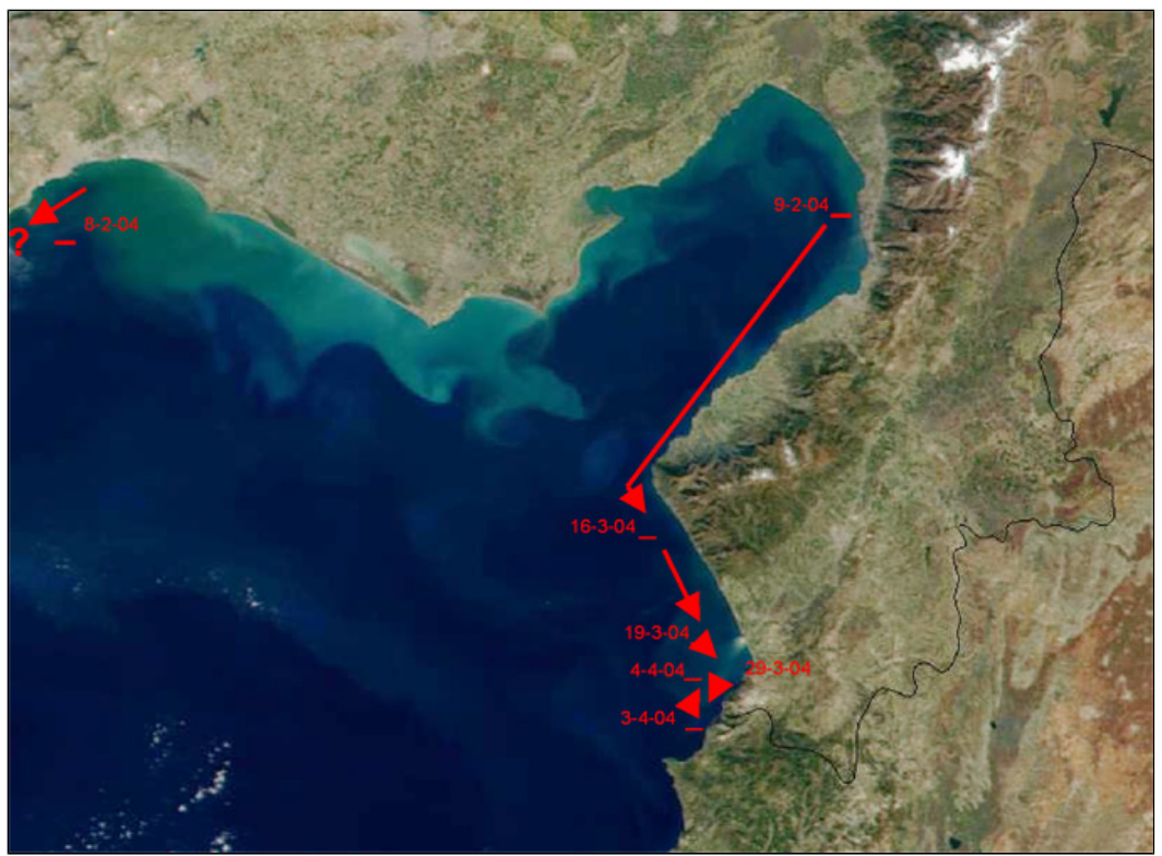
Figure 1. The locations of the recent seal sightings in the Levant Sea.

Almost 10 years ago, the first pup identified by the METU-IMS team in the Cilician Basin was named "Arab" because of his paradoxically bright dark coloration. He was, probably, the son of the dominant male in the region called "Kahramanmarasliabdullah" or "KAMASH" for short. Later, as the data on the seals of the Cilician basin were accumulated, so the social structure of the colony started to become evident and suggested that a large adult male rules over a region with an arbitrarily estimated home range of 37 to 56 km. Within the range of a single adult male, the rest of the individuals tend to gather into small and separate groups. Each group was then observed using only certain caves within each of the sub-regions. This sub-group structure (a single adult male with one or more reproductive females using selectively the same caves) may resemble a form of polygyny. Habitat partitioning by sub-groups exclusively using certain caves, the presence of home ranges for each of the adult males, and the presence of a single adult male per social group were indicators of territorial behaviour.