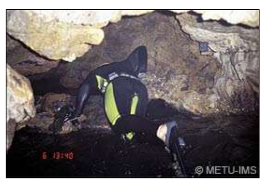
Photo 4. A member of the research team 'hauls out' to demonstrate the size of the platform.

In another instance, a cave lacking a suitably large platform on which a seal could comfortably rest, and hence not initially considered important by the research team, was later proven by the monitoring system to be the most actively used cave in the area (Photo 3). Careful scrutiny of this photograph reveals not only the individual on the platform, but also the flipper of a second seal in the water. A third individual can just be made out at the anterior of the seal on the platform. The greatest number of seals that researchers have observed sleeping side by side on the platform is 4.