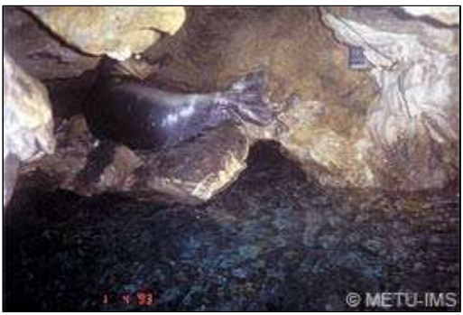
Photo 2. The camera picks up the change in pelt colour, from black...

Of particular importance to identification criteria, the pictures also provided useful information on the colour ranges of individuals. revealing how pelt colour may change within a couple of hours and turn from black to light grey (Photo 2 and 3) due to drying.