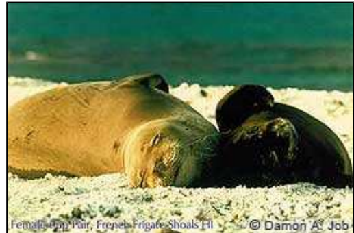
Female with pup on East Island, French Frigate Shoals

I have a collection of Hawaiian monk seal ( Monachus schauinslandi ) vocalizations available for analysis. Details are provided below. If any professional researcher is interested in using this collection of vocalizations for analysis, please contact me at: monkseals@hotmail.com . I would be interested in co-authorship, but it is not essential.